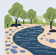
Streamside Vegetation Management