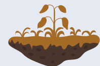
Soil Health + Erosion