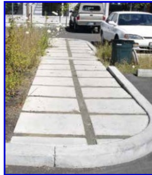
Paving stones in Portland.

Porous Concrete: a mixture of cement, water, and coarse aggregate, allowing up to 5 gal/ft 2 /min to pass through ( Portland Cement Association ).