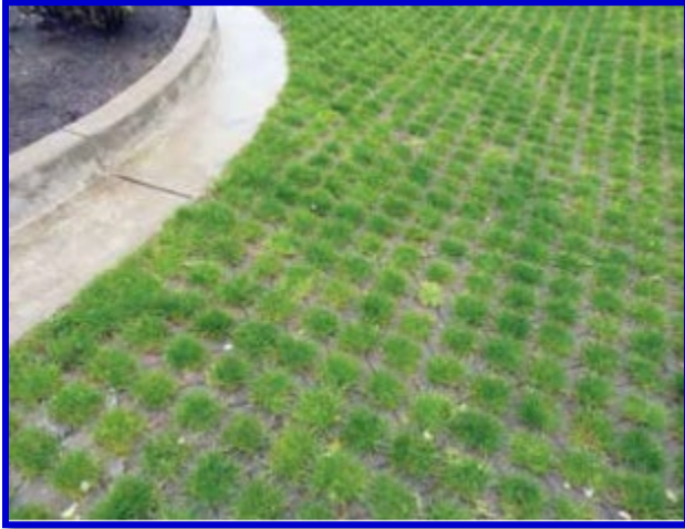
Grass Pavers in the Willamette.

Grass Pavers: also called turf pavers; open cells made of concrete or plastic that allows grass to grow through them.